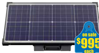
Speedrite S3500 Solar Energiser