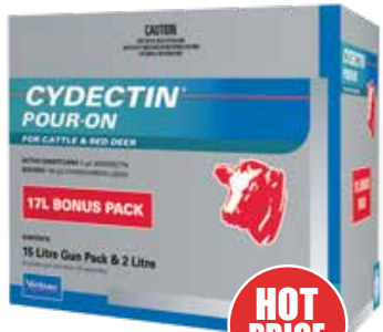
Cydectin Pour-On Drench BONUS Gun Pack - 17L 808084