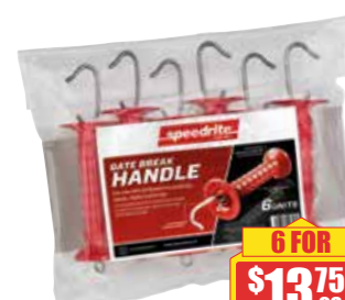
High Tension Gate Break Handle - Red