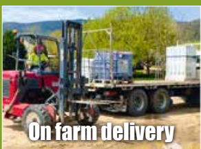
On farm delivery