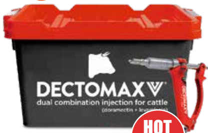
Dectomax V Injectable Parasiticide - 6 x 500ml 750153