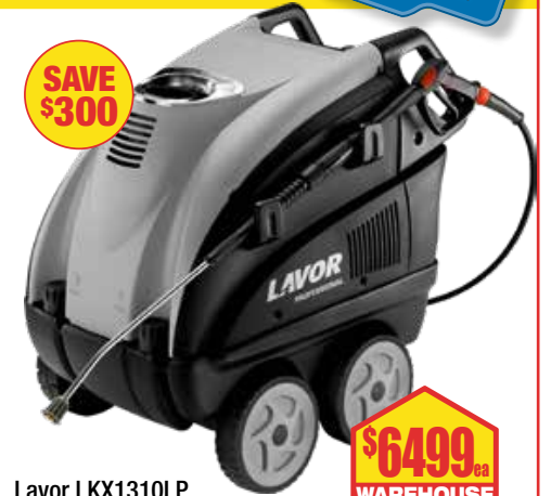
Lavor LKX1310LP Dairy/Farm Pack