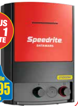
Speedrite Energiser 31000W