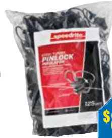
Speedrite Steel Post Pinlock Heavy Duty - Bonus Bag 125