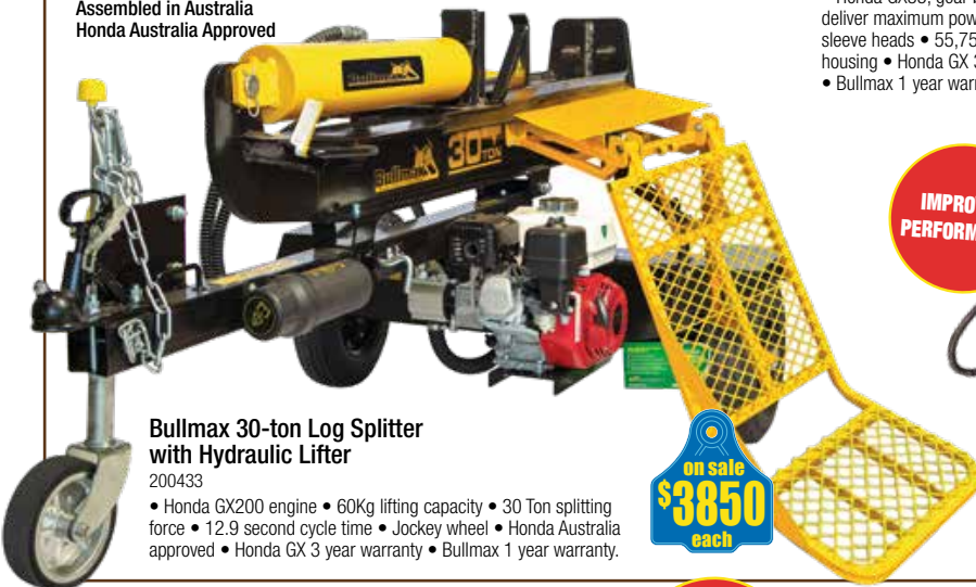
Bullmax 30-ton Log Splitter with Hydraulic Lifter

Bullmax POWERED by HONDA Assembled in Australia Honda Australia Approved