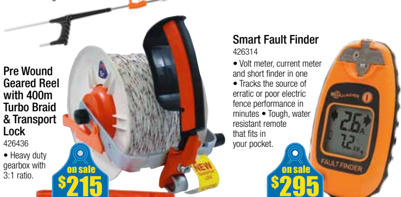
Pre Wound Geared Reel with 400m Turbo Braid & Transport Lock