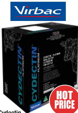
Cydectin Platinum Pour On - 10L 650055